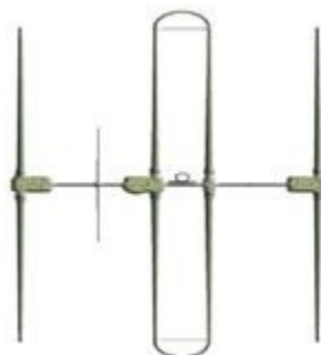
3 element with 30/40 dipole, 6m passive options